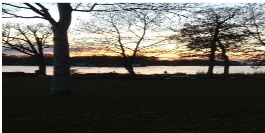
Quaker Haven Fall Impact 2012

Thanks to all those who came together to make our retreat a true Impact! See ya next year!!!