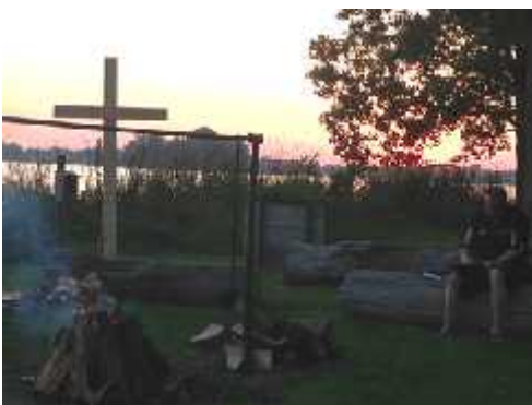
Sr. Hi 2 Campfire