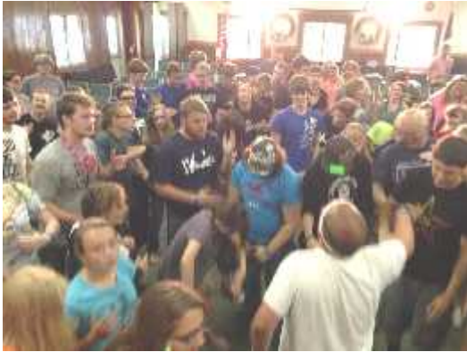
Sr. Hi 1 Chapel