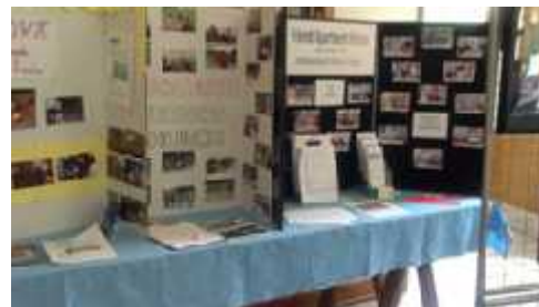
Displays lined the foyer and continued into the Kendal Room.