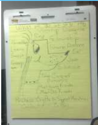
We did business.