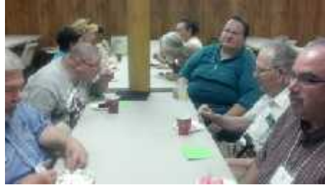
Jabbering more than jamming was heard at the "Afterglow" on Thurs. and Friday nights.