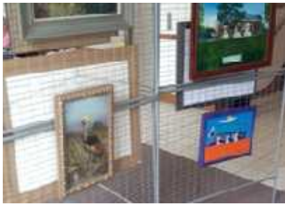
Displays of paintings, photos, sewing, embroidery, knitting and pottery were displayed around the meeting house.