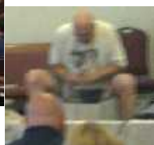
Sustenance once again.