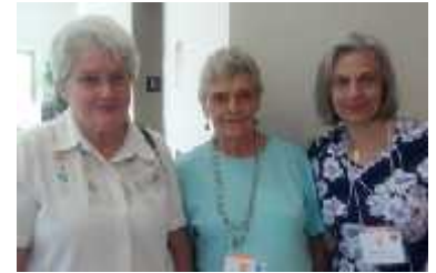
Meeting old friends