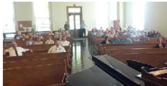
Sunday Morning Worship followed the Concert of Music. The Concert was perhaps the favorite part of Sessions (except for the business). The devotions, Sunday service and the Quaker Lecture will be available on CD from the office.