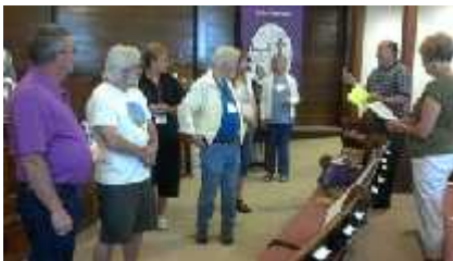
Workshops with affiliates were held Sat. morning.