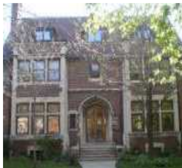
57th Street Meeting-house

Nov 24: Meeting as a Place of Transformation, pp. 26ff