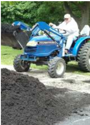
Earl Carpenter spreading the "real" dirt about (around) the YM grounds.

labels and Box Tops for Education for Choctaw Friends Center, and we are recycling medicine bottles. (Please note that the Campbell's soup labels need to include the front label and UPC part. You can trim off the rest of the label.)