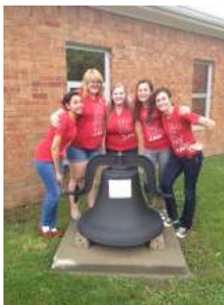
Youth Cabinet at Coloma

Lyon Girls helping with the 1st Sap Run at Quaker Haven.