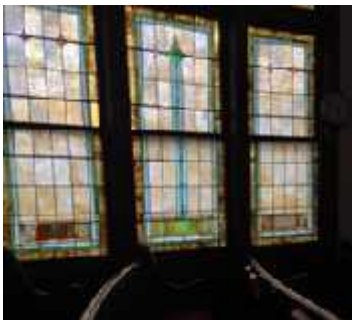
Windows of Gray Friends Meeting in the afternoon sun.