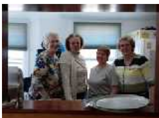
Park County Friends Meetings worked together to provide lunch.

9. From Executive Committee: It was approved to relinquish our rights to first refusal on the NE corner property which we have not owned since the 1950's.