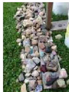
Sr Hi Students decorated rocks to represent the burdens they were prepared to give over to God.