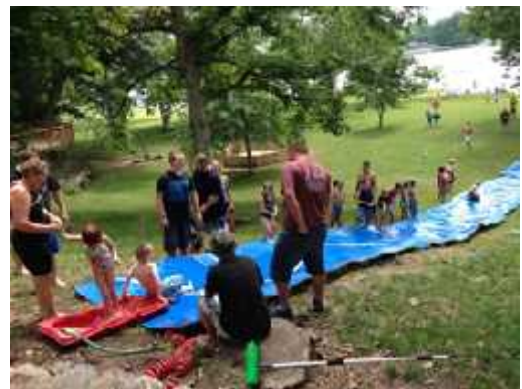
Parents and kids enjoy the giant slip and slide at Beginner's Camp