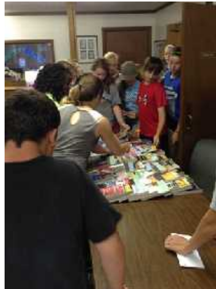
Jr Hi Students picking out books that were provided by the Peace and Christian Social Concerns Committee.