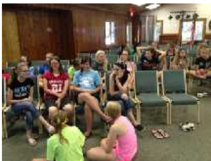
Quaker 101 Class—Sr Hi Students learn about Quakerism in one of the teaching Sessions.