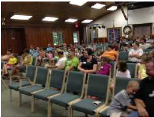
Beginner's Camp opening worship session. Just getting ready to sing songs!