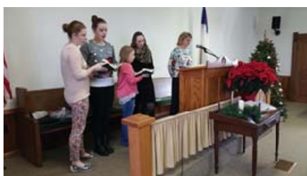
Christmas at Hopewell Friends Meeting.

Sandcreek-Azalia had a goal of 25 shoeboxes to send to the Samaritan's Purse Operation Christmas Child shoebox project! We exceeded our goal by 14 boxes!!! We had a total of 39 boxes this year!! We were very excited to be able to share with children worldwide and help spread God's word!!!