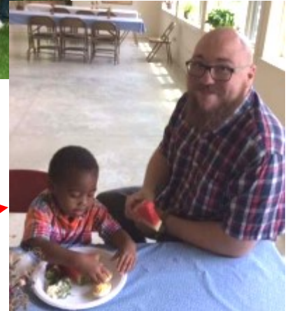
Memorial Day celebrations Coloma Friends Meeting Downers Grove Friends