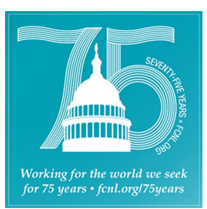
Friends Committee on National Legislation, 75th anniversary!

Here are a few of the quotes from that meeting: